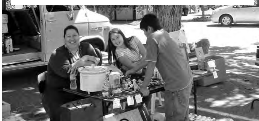
Spanish Flat Parking Lot Sale - Great Bargains - Great People See You There Next Time!

Networking & Security Available Upon Request