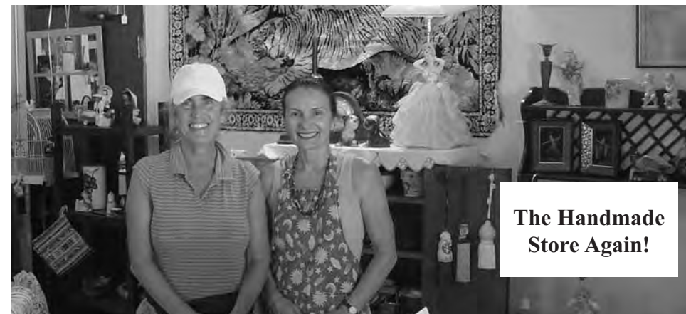
The Handmade Store Again!

"Is that so! And how, may I ask, did a bartender cure you?" "He told me to cut the legs off the bed! - Ain't nobody under there now !!!"