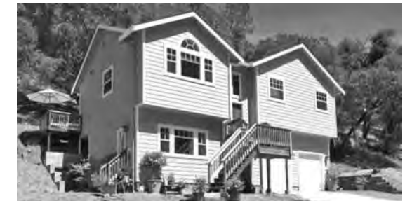
Berryessa Highlands - Offered at $520,000

Gorgeous custom home built in 2006! This 2 story, 3+BR, 3 BA home features an open floorplan, a beautiful kitchen with granite counters and wood floors. Additional features include office/den, 2 car garage, room for boat/RV parking and so much more! Wooded setting and peaceful!