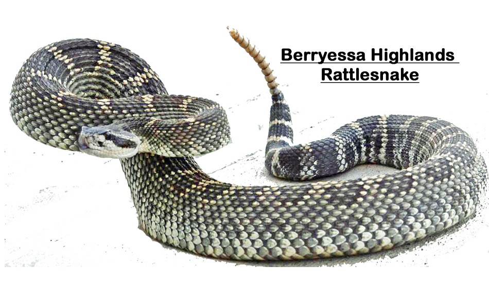
Berryessa Highlands Rattlesnake

The California Poison Control Center notes that rattlesnakes account for more than 800 bites each year