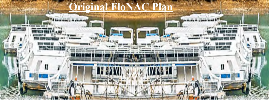
Original FloNAC Plan

Lake Berryessa is an official FAA seaplane base so access to the casino for high rollers is guaranteed. Seaplane ferry service is already being developed from regional airports as well as, Las Vegas itself. ICON